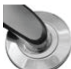
TAPER = TAP