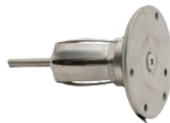
Grab Bar Wingits (GBW40) x 2