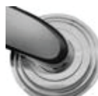
TRI-STEP = TRI