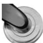
BEVEL = BEV