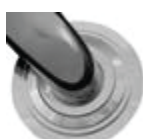
BAND = BAN