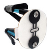
RES Wingits (RESGBW35) x 2