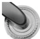
ROPE = ROP