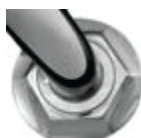
HEX = HEX