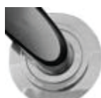
HALO = HAL