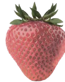
LOW CRI below 80