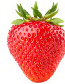
HIGH CRI 85+