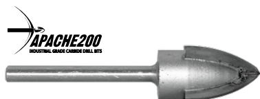
Industrial Grade Carbide Drill Bit